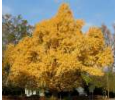
Ginko Tree is in used pots, please disregard any code written on the pot.