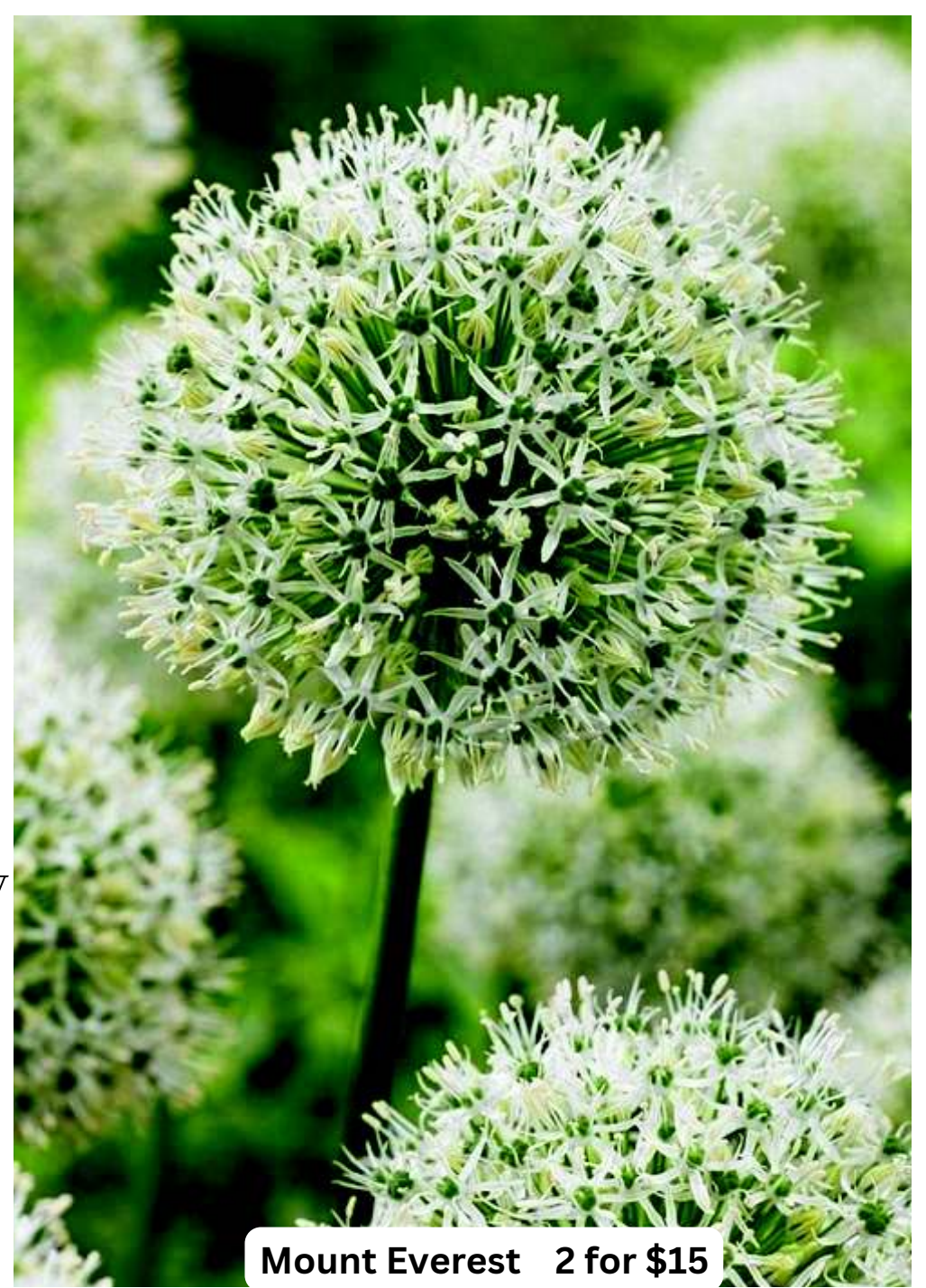
Best planted in fall, allium are extremely hardy and prefer a drier location. Deer resistant. Full Sun