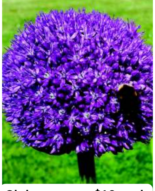
Globemaster $10 each